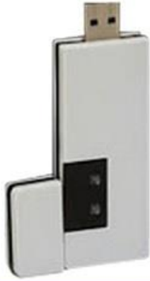
Second-Room Receiver $295

Second receiver helps you recover from a loss, or damage caused to the primary device, or split your keypads into multiple groups.