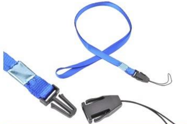
Keypad Lanyards with Safety $250 per 250 lanyards

Second receiver helps you recover from a loss, or damage caused to the primary device, or split your keypads into multiple groups.