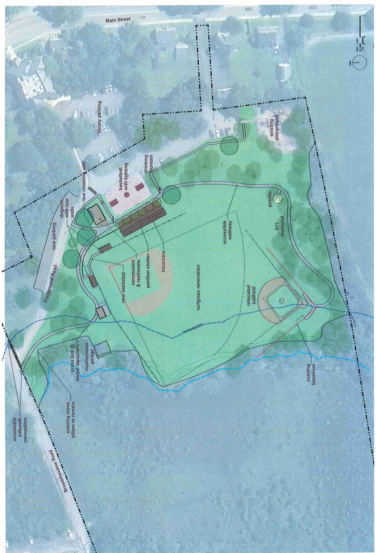
Town Field - Conceptual Site Plan October 23, 2024